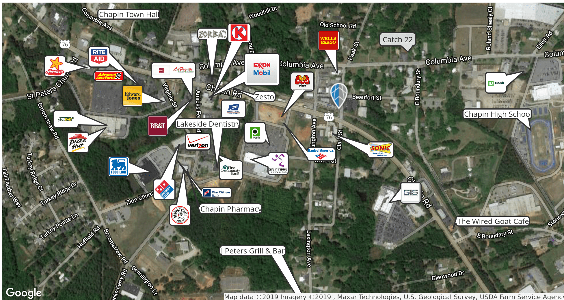
Map data ©2019 Imagery ©2019, Maxar Technologies, U.S. Geological Survey, USDA Farm Service Agency